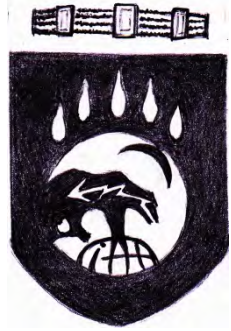
order of Godland