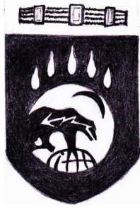
order Godland Östersjövöldet